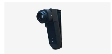
WALL MOUNTED ZOOM CAMERA

To read more about how the systems works, please visit: www.coms.net.nz/the-guardian