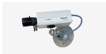
STANDARD ZOOM CAMERA

Price excludes installation and pre-wiring requirements.